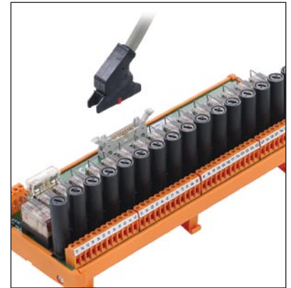
Encapsulated Flat Connector with Strain Relief for Relay Outputs