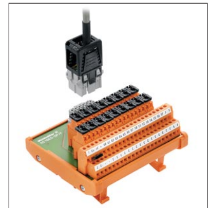
Industrial RSV 1.6 Connector for Direct Inputs with Voltage >50V